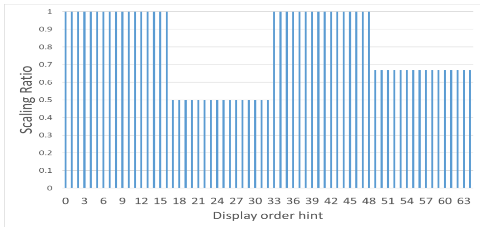
Figure: scaling ratio of RA with resize mode

The following two figures show the periodic pattern of resolution switching for RA and low delay configurations.